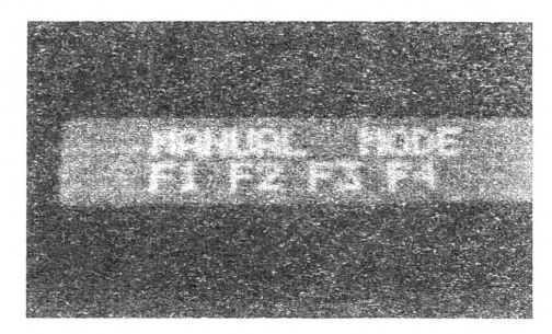
Figure 6: Manual Mode