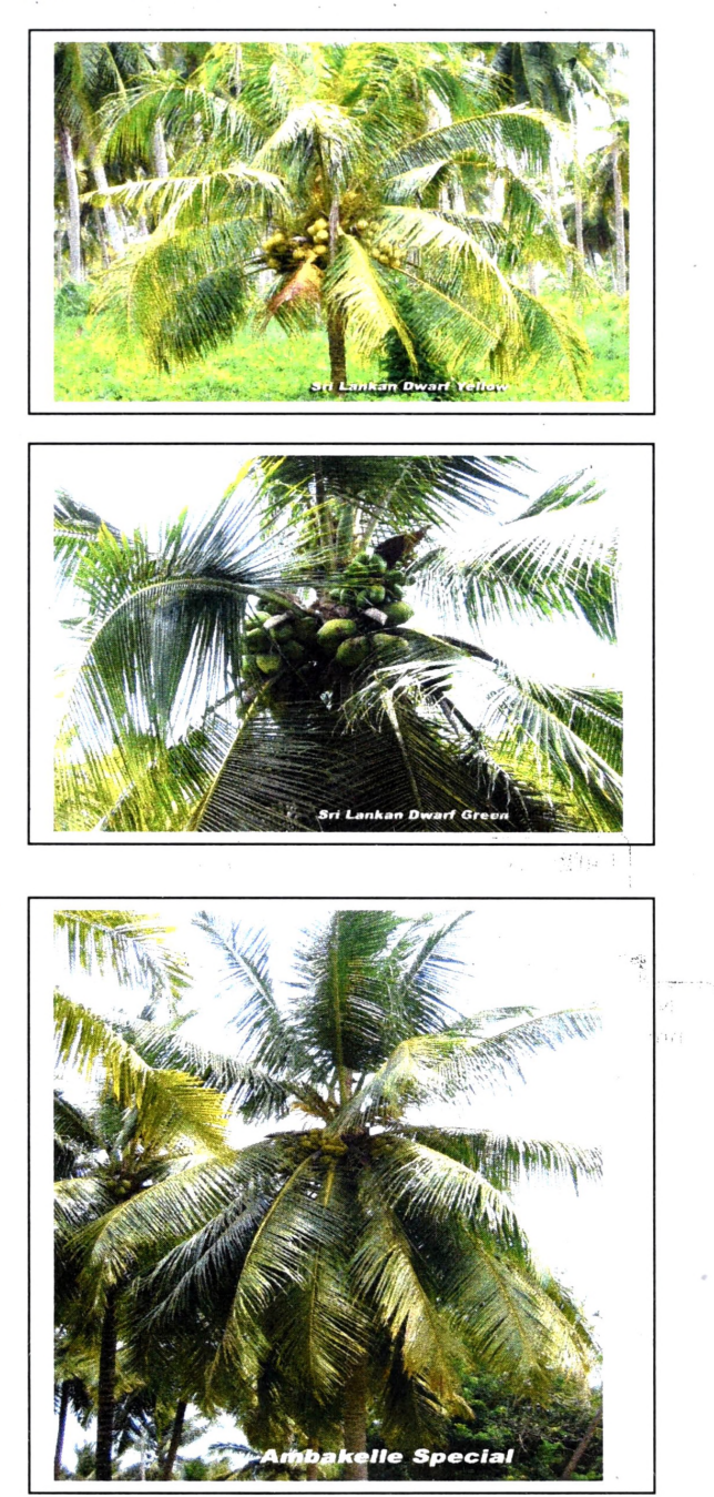
Figure 1. Three different coconut forms, Sri Lankan Dwarf Green, Sri Lankan Dwarf Yellow and Ambakelle Special.

was under natural infestation, were screened, from March to June 2005.